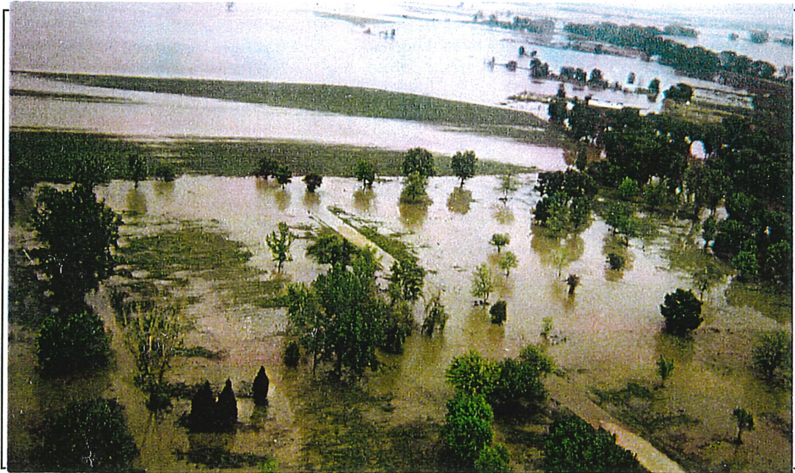
Princess Jodi Mobile Home Park, 1995

Prepared by State Emergency Management Agency